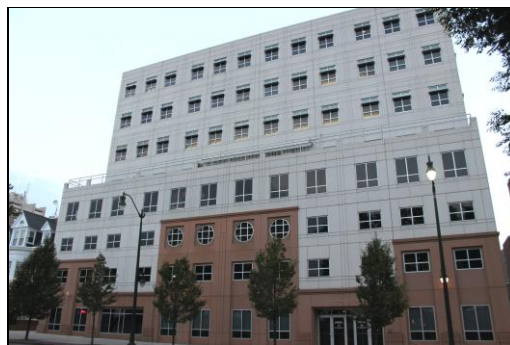
PHFA's headquarters in downtown Harrisburg.