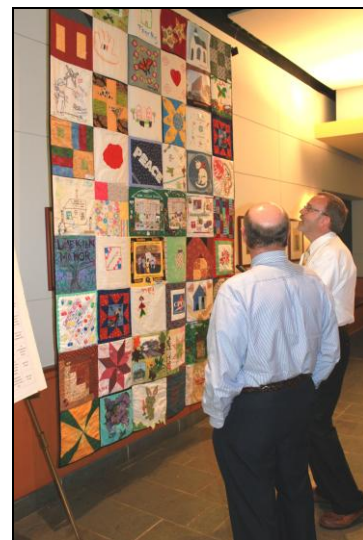
One of the Common Thread Quilts on display.