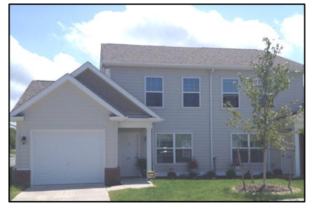
Arneman Place opened in mid-August in Harborcreek, Erie County. The community is a new construction community with eleven townhouse buildings consisting of 50 units. The project was made possible, in part, with tax credits from PHFA.