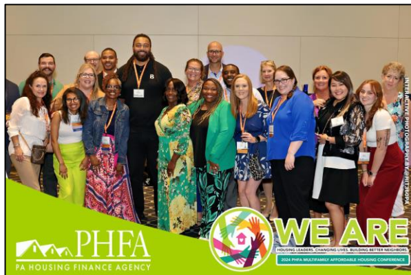
PHFA staff who run the MAHC

The 2024 Multifamily Affordable Housing Conference (MAHC) was held in late June at the Penn Stater Hotel and Conference Center, attracting 525 attendees. This year's conference had a theme reflective of its location near Penn State: “We ARE...Housing Leaders. Changing Lives. Building Better Neighbors.” Forty-seven breakout sessions offered a mix of property management, supportive services, and personal growth topics. In addition to the breakout sessions, each day featured a keynote speaker.