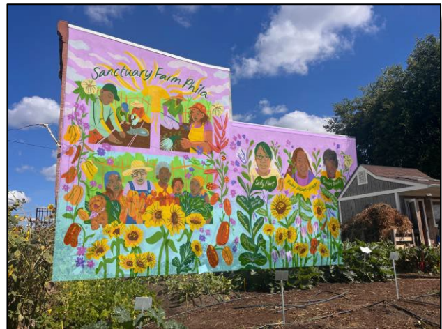
A digital mock-up of the Sanctuary Farms mural.

The Pennsylvania Housing Affordability and Rehabilitation Enhancement Fund (PHARE) is known for funding thousands of affordable housing initiatives in all 67 counties. But most recently, PHARE has joined Mural Arts Philadelphia to help fund a mural project throughout Philadelphia. The project not only will beautify Philadelphia neighborhoods but will also bring community members together through the creative process.