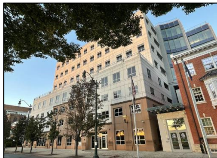
PHFA main office in Harrisburg

These tax credits will be used by the winning bidders to reduce their state tax liability. The bidders can be companies, organizations, or individuals. The intent of the bidding process is to raise as much funding as possible from the $4.5 million in tax credits being made available to provide for a significant communities. The projects to receive this funding will be selected during a competitive Request for Proposals process later this year.