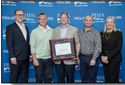
Representatives from CrossCountry Mortgage accept Top Lender award

PHFA honored its top lending partners for 2025 during its annual Homeownership Award event, held at the agency's headquarters in Harrisburg in April.