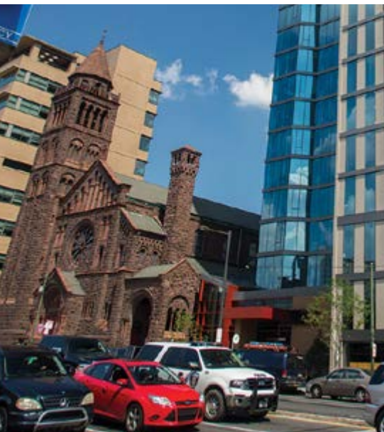
The Philadelphia Episcopal Cathedral is seen on the left. The new 26-story residential tower is on the right. In the middle was built a three-story office building, which includes a community center and a childcare facility.