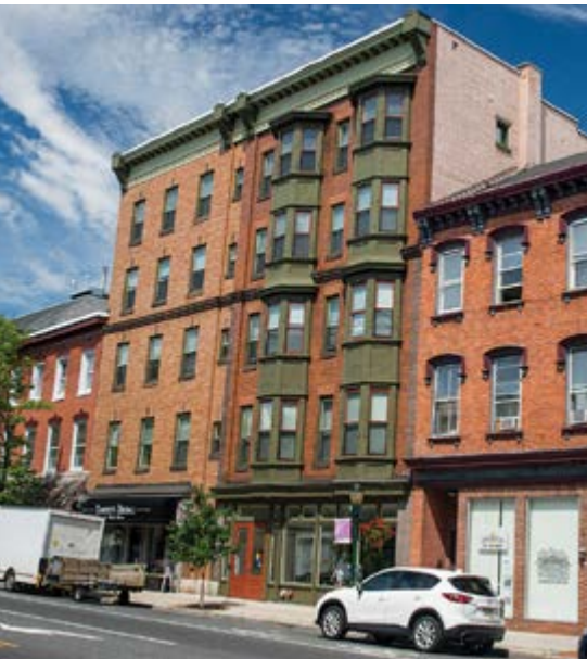
The Historic Molly Pitcher Apartments in downtown Carlisle—the middle building with the brick and green façade—was rehabilitated to provide affordable rental housing using tax credits provided by PHFA.